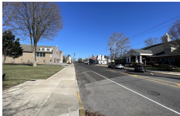
77.33 ft Frontage on High Street

Prime Location! Situated on High Street, directly across from City Hall, providing excellent visibility and accessibility.