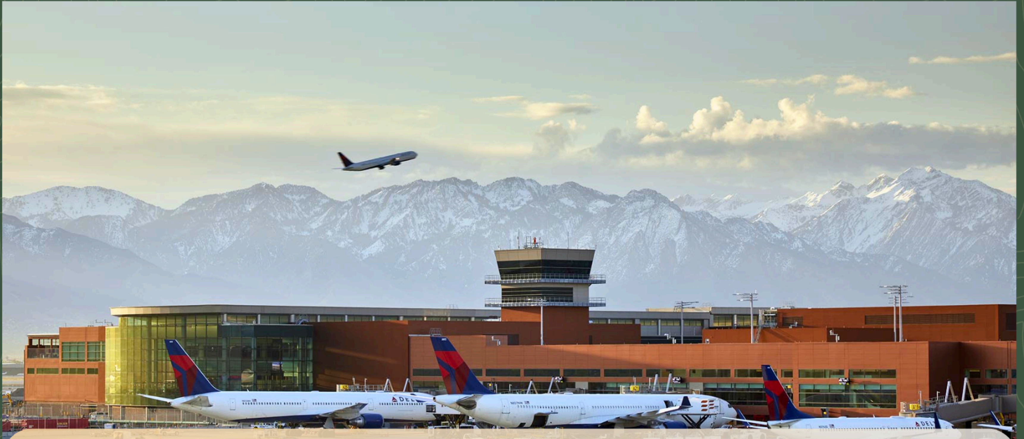
Salt Lake City International Airport