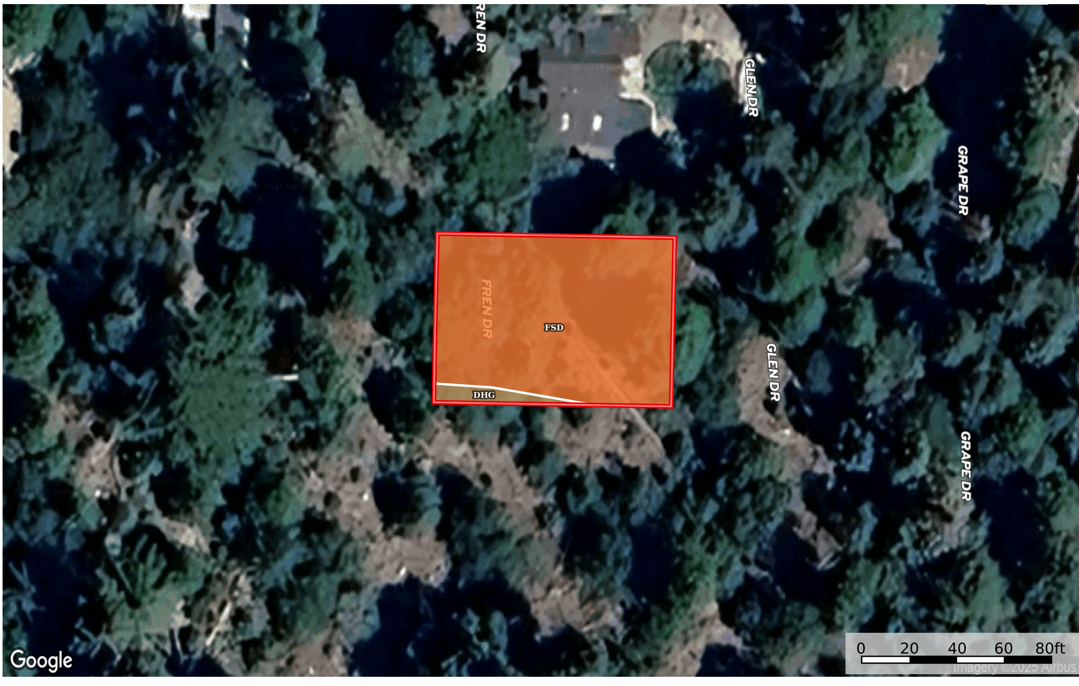
0.14 Acre Forest Falls, San Bernardino County, CA 0323 -San Bernardino County, California, 0.14 AC +/-