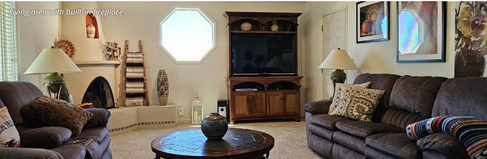
Living area with built-in fireplace