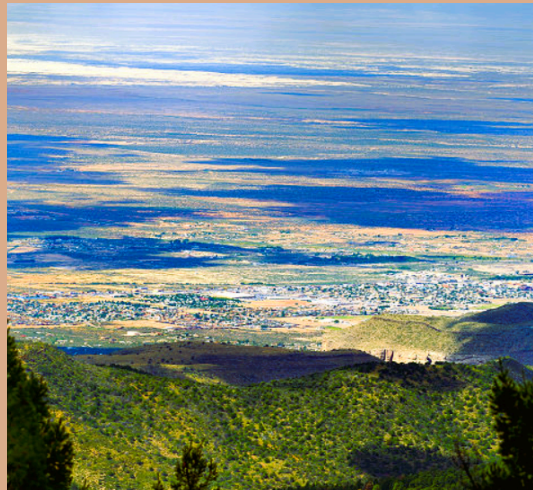
Cathey canyon 20 miles away from property