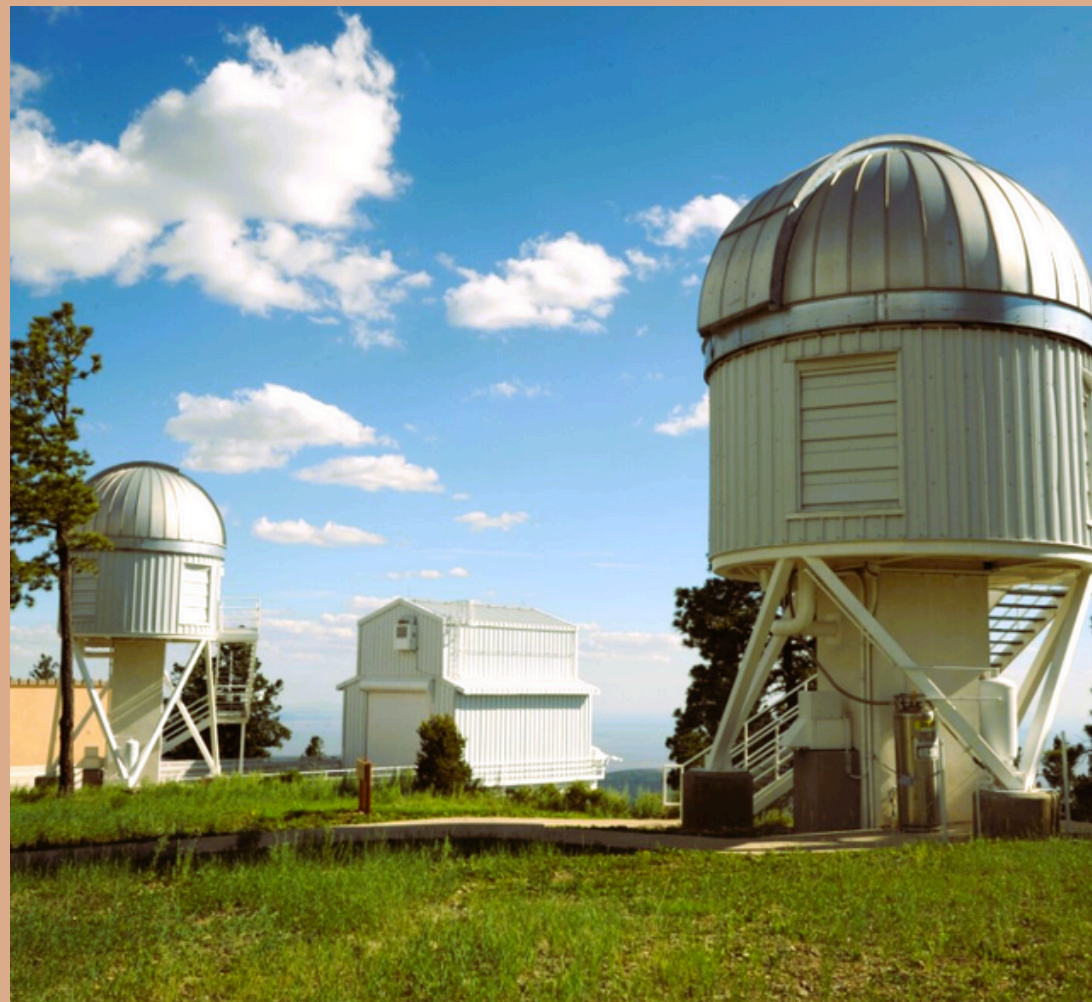
Apache Point Observatory 20 miles away from property