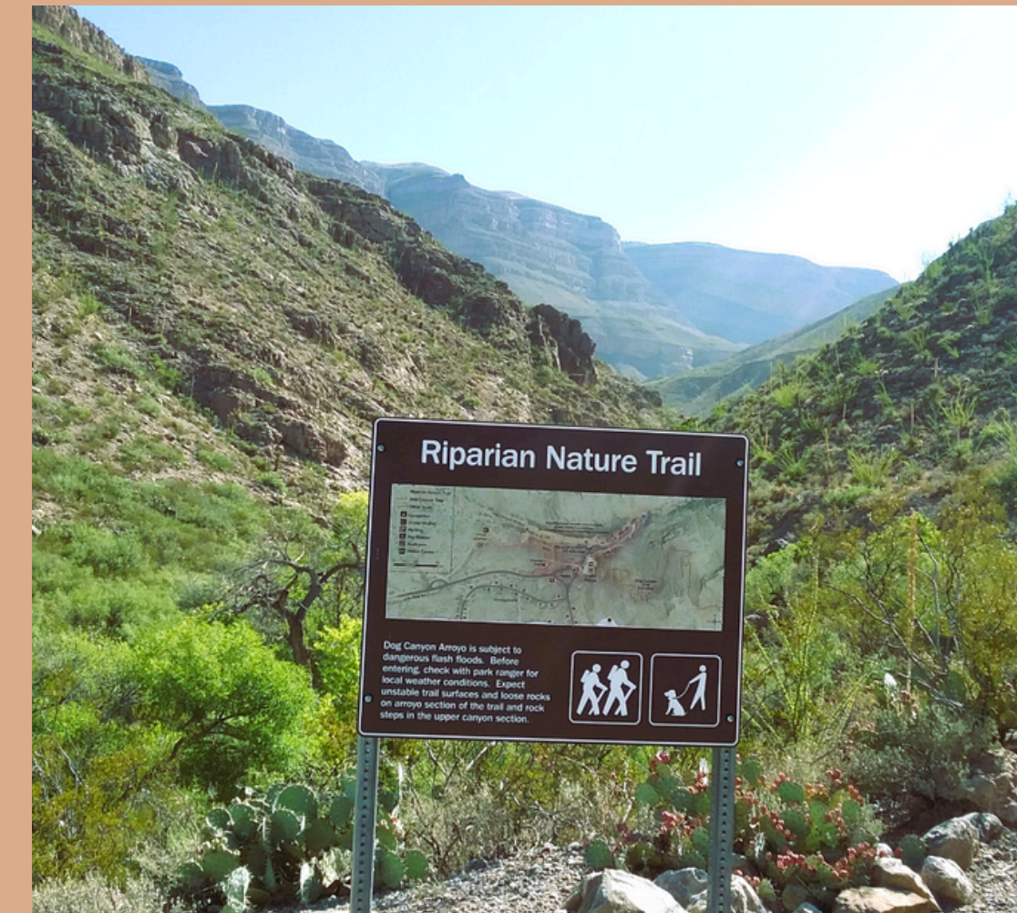
Riparian Nature Trail 70 miles away from property