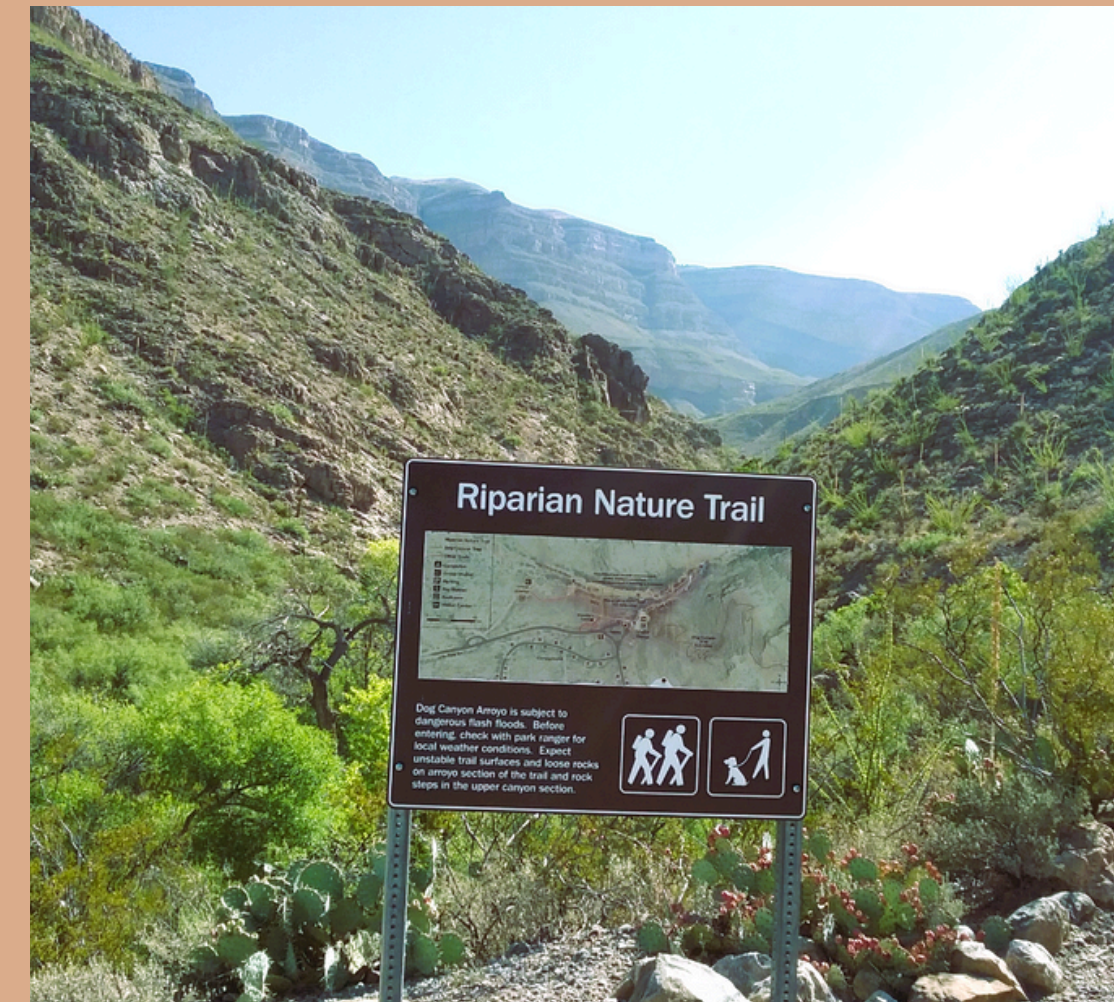
Riparian Nature Trail 67.4 miles away from property