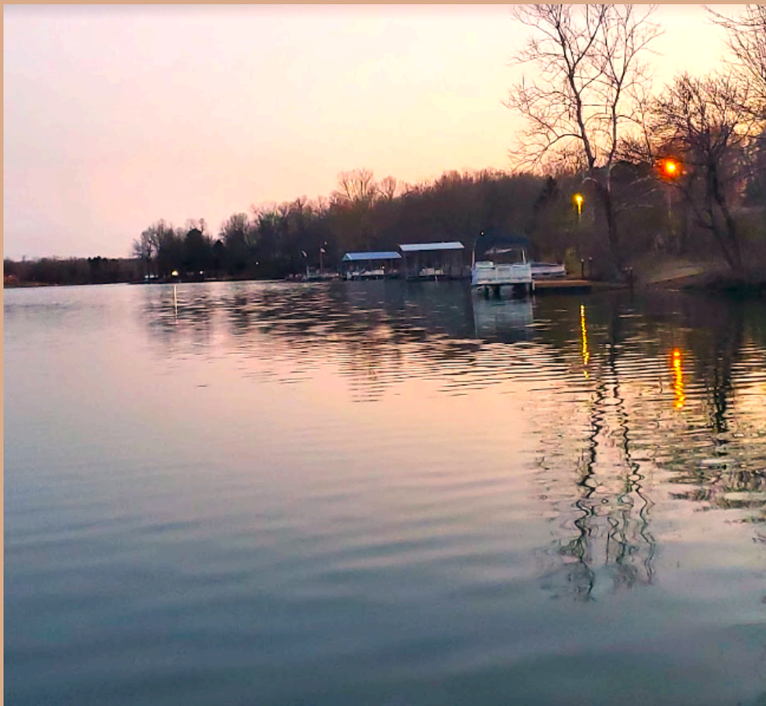
Crown Lake Pier