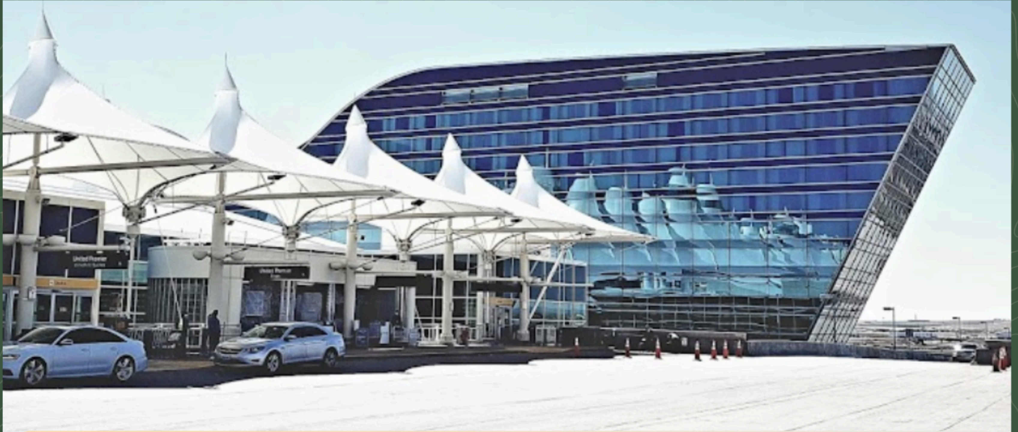
Denver International Airport