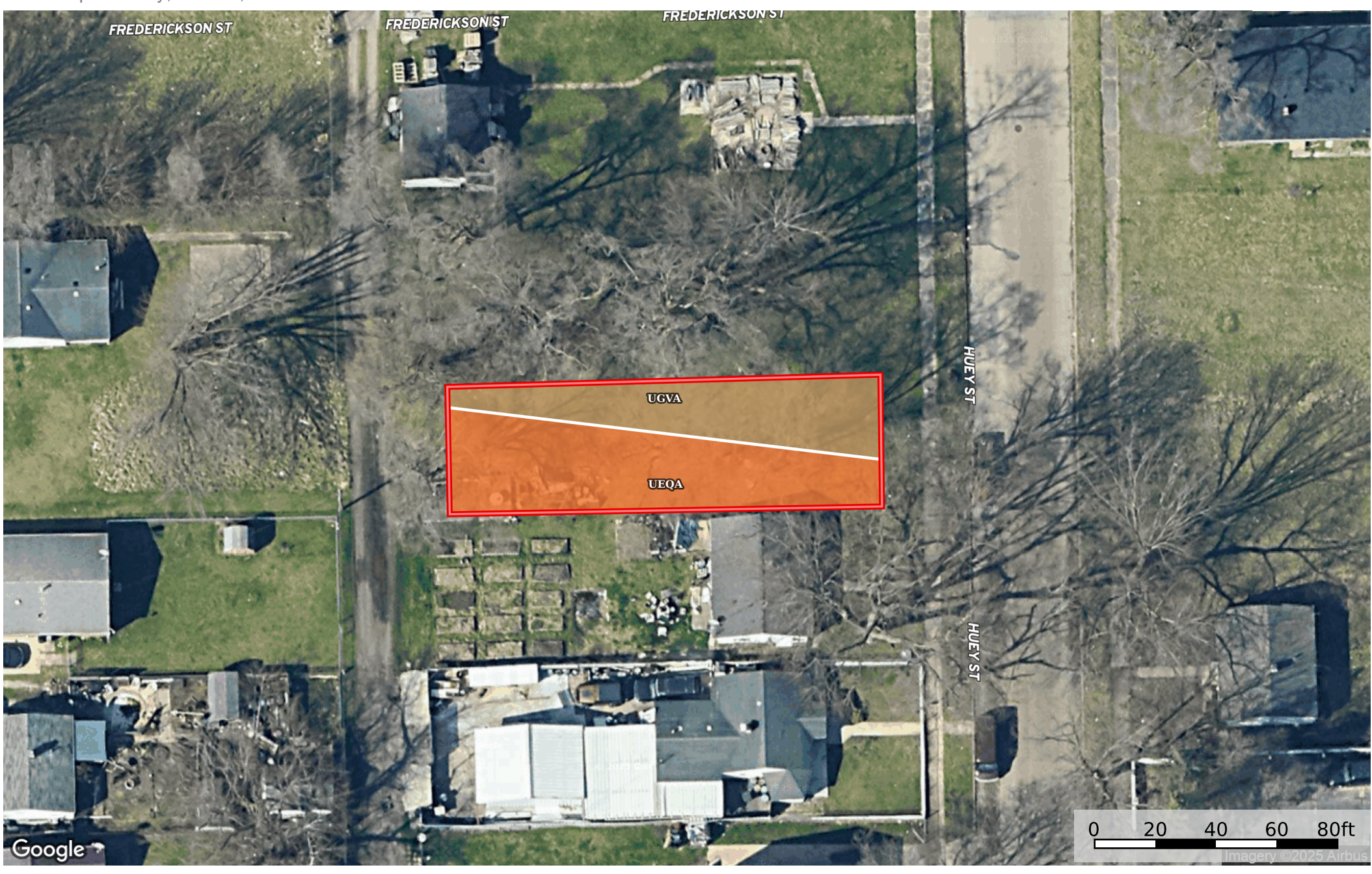
0.14 Acre South Bend, St. Joseph County, IN 71-08-03- St. Joseph County, Indiana, 0.14 AC +/-