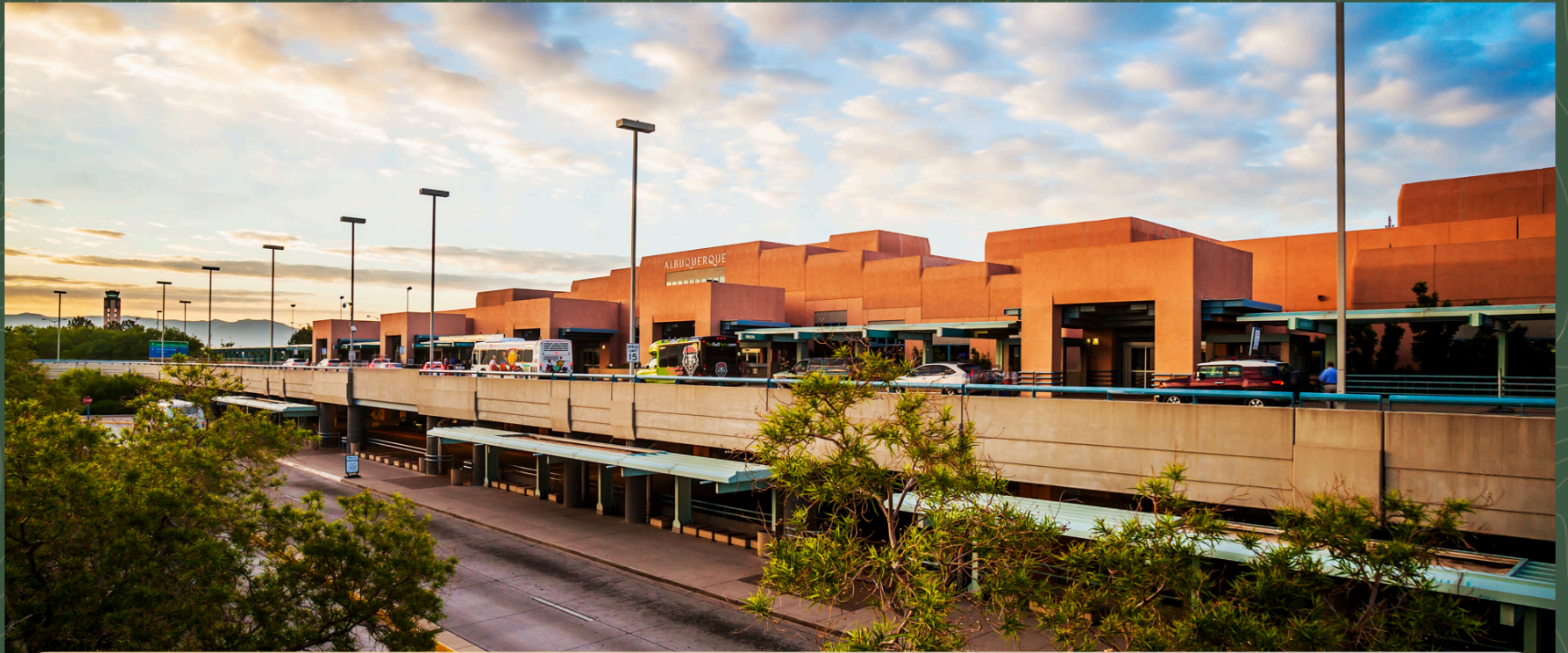
Albuquerque International Sunport